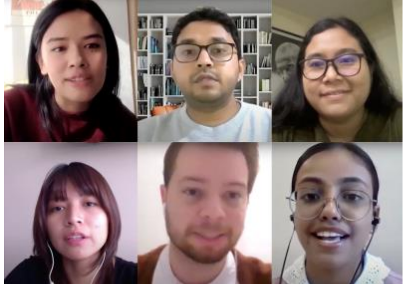
2022 Participants of the Asia Society Korea (ASK-Y) program

December 15, 2022 — Asia Society Korea held the final session of the 2022 “ Asia Society Korea Youth ” program, marking the end of another fruitful initiative. From October to December, the panel of six met bi-weekly to discuss key global issues and their relevance to youths.