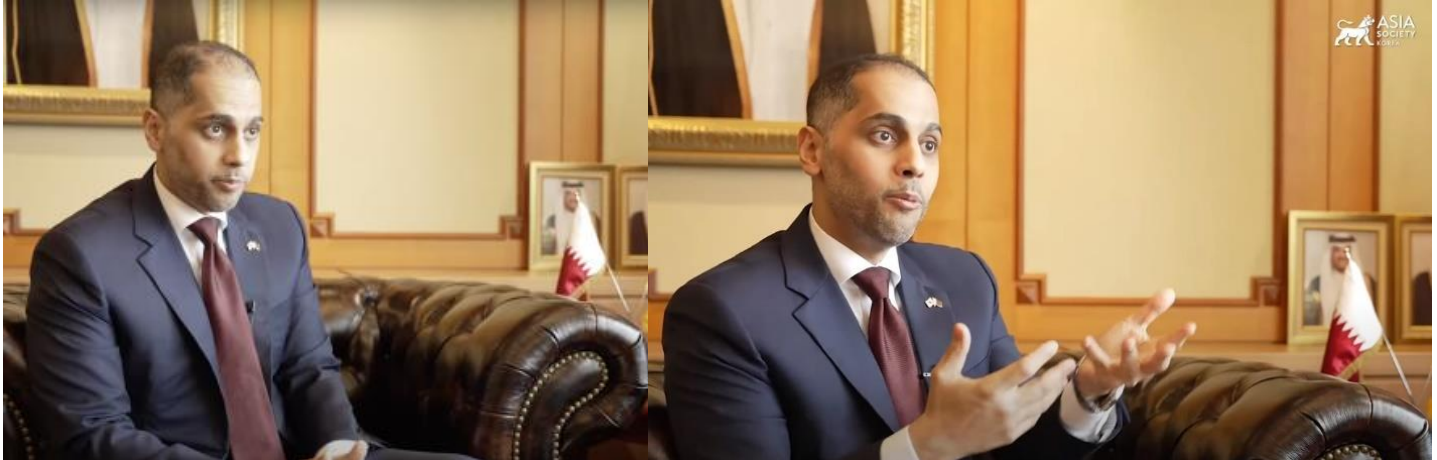
Interview with H.E. Khalid Ebrahim Al-Hamar, Ambassador of the State of Qatar to the Republic of Korea

October 7, 2022 — In this latest installation of the Ambassador Series , H.E. Khalid Ebrahim Al-Hamar, Ambassador of Qatar to the Republic of Korea, invited Asia Society Korea to the Qatar Embassy in Seoul to discuss the significance of the Qatar World Cup 2022 , bilateral relations, and the Qatar National Vision 2030 . The ambassador focused on the advancement in the relationship between Qatar and South Korea since establishing formal diplomatic relations in April 1974 , and how the approaching World Cup creates the opportunity for both countries to strengthen existing bonds. His Excellency also introduced unique Qatari decorations and art pieces located at the Embassy that hold great cultural and traditional significance.