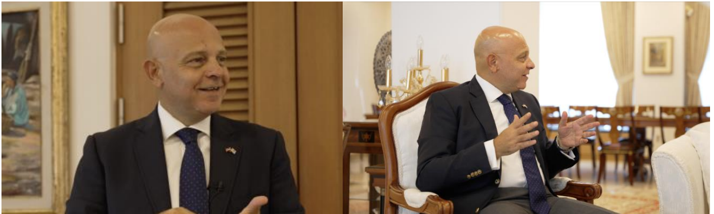
Interview with H.E. Khaled Abdelrahman Hassan Abdelrahman, Ambassador of Egypt to the Republic of Korea

September 26, 2022 — Ambassador of Egypt to the Republic of Korea, H.E. Khaled Abdelrahman Hassan Abdelrahman, speaks to Asia Society Korea about his efforts towards environmental advocacy, unique similarities between the two nations, and various visions of the future. The ambassador emphasizes the importance of increased collaboration between Egyptian and Korean companies that will lead to both cultural and economic growth for the two countries. The interview also highlights the increasing interest in not just K-content but also the Korean language amongst Egyptian youth, while providing insight into job opportunities in Egypt and the future of the country.